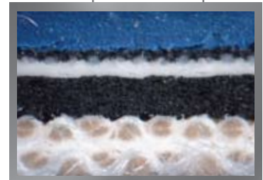
Dot Gain Curve (50%)